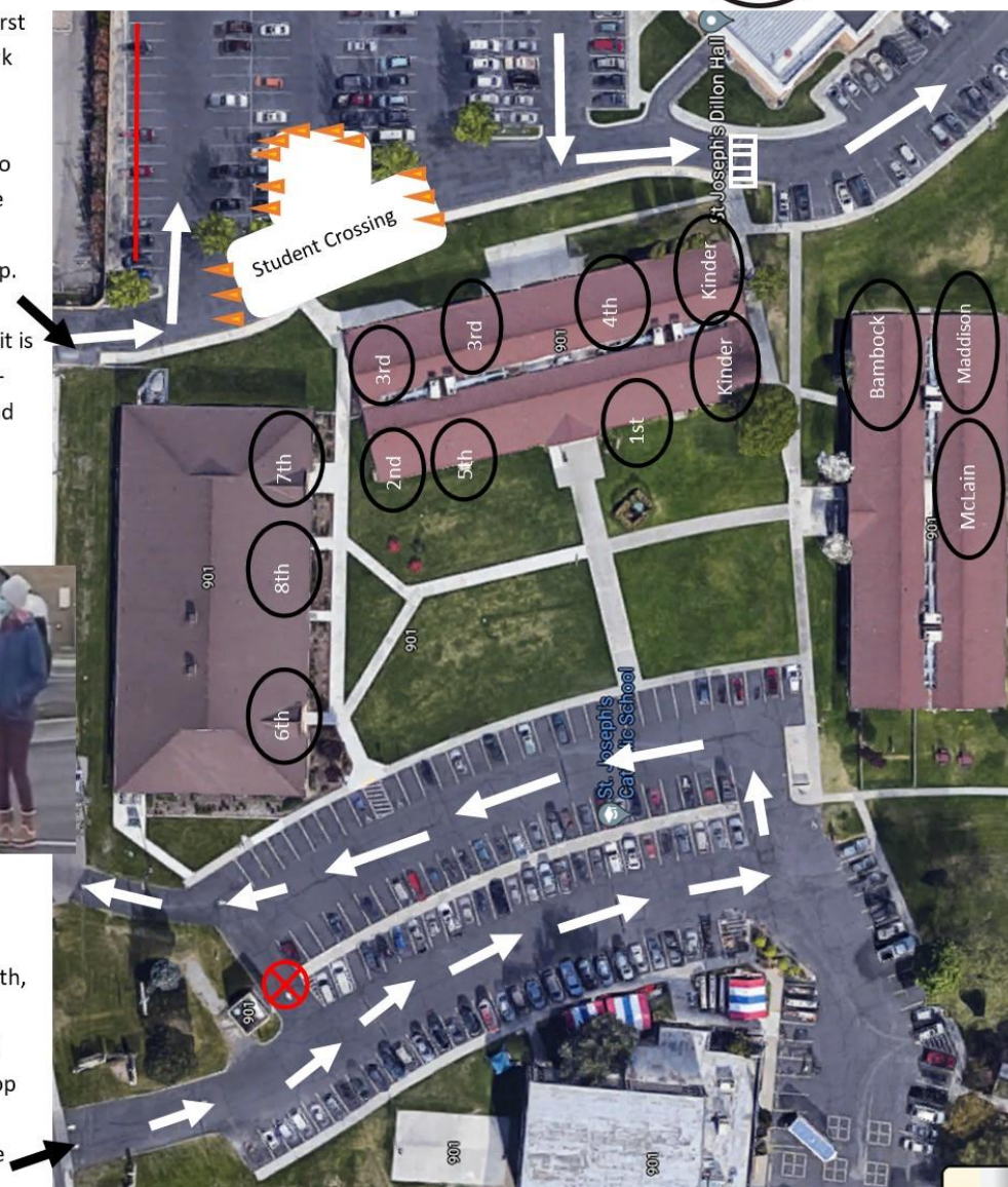
St. Joseph Catholic School Parking area map.

Parents who enter from 4th, West of the school sign, need to follow directional arrows. Please do not drop off students in the area marked with the x. Please fully park your car when dropping off children. We are reviewing this area and will likely add a crossing area from the center sidewalk to the school sidewalk.